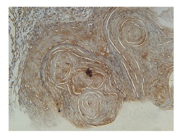
Figure 1. IHC results for EGFR at magnification of 40x. EGFR negative (left) and EGFR strong positive (right) with >60% of cells showing membraneous and cytoplasmic staining